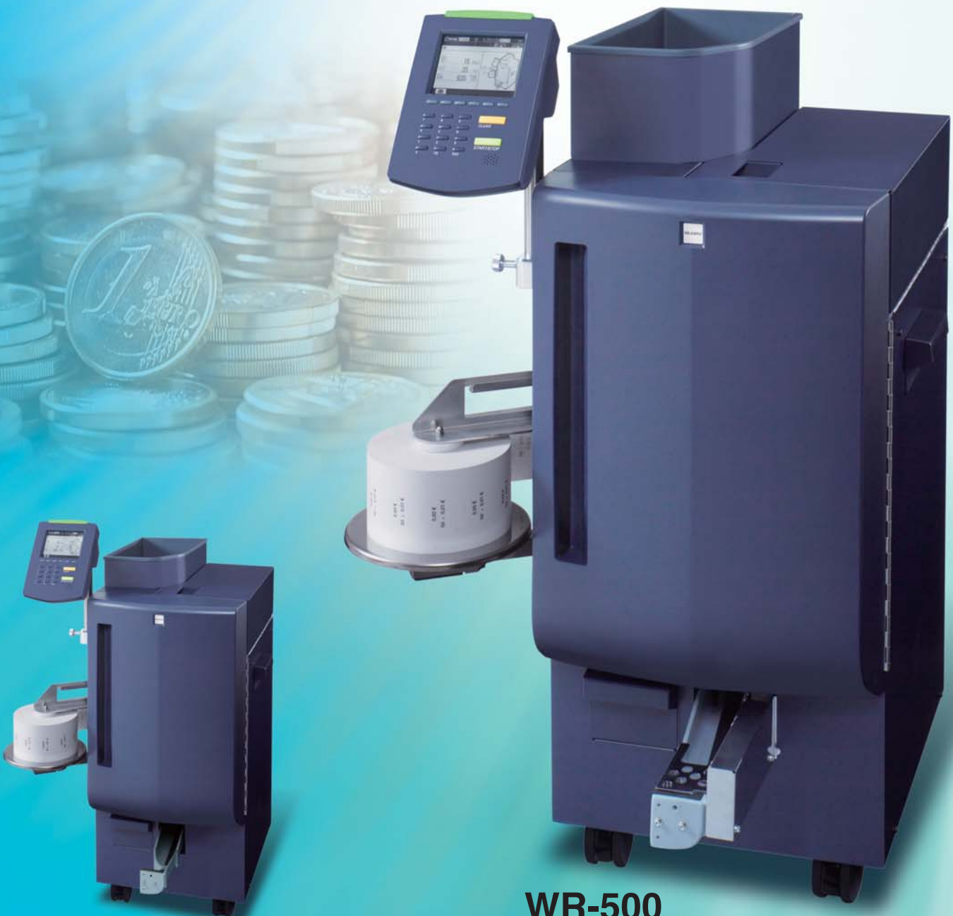
WR-90 Standard model