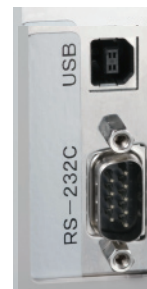
Equipped with USB and RS-232 (DB-9) ports.